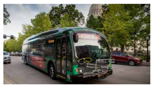
This all-electric bus has a battery range of up to 250 miles.

Transportation accounts for more than 25% of greenhouse gas emissions in the United States. MGE is working with residential, commercial and fleet customers, both public and private, to grow the use of electric vehicles to advance shared energy goals, such as reduced carbon emissions, and to enable future market growth.