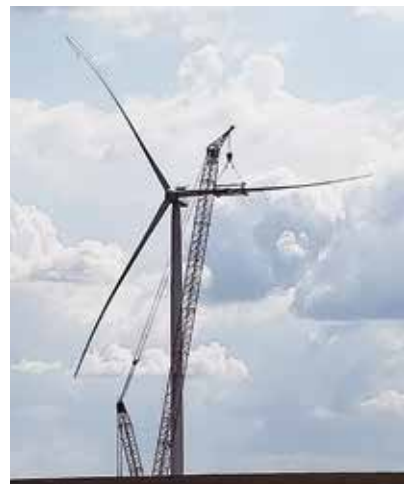
Construction in mid-September at MGE's Saratoga wind farm in Howard County, Iowa

MGE is participating in the Edison Electric Institute's (EEI) environmental, social, governance and sustainability-related reporting template. The voluntary, industry-specific template will provide MGE Energy investors current and concise data and information on our portfolio, emissions, capital expenditures and other matters. The tool advances further transparency and disclosure in company operations and governance.