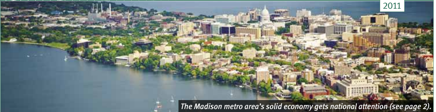
The Madison metro area's solid economy gets national attention (see page 2).