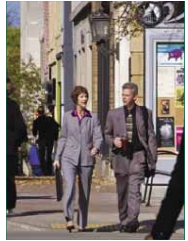
Madison receives high rankings for its strong economy and low unemployment.

Forbes recently listed Madison as the third best city for young professionals. Forbes cited our job growth, low unemployment, large college-educated population and reasonable cost of living.