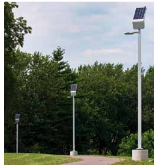
Photovoltaic panels sit atop light poles in Thut Park in Madison. The solar panels power new bright LED lights.

MGE has solar installations across its service area in public places to help educate our customers while we compile and study performance data. In this way, we can work with others in learning which technologies best meet the needs of our customers.