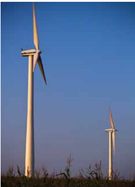
MGE currently has 12 times the wind capacity that it had in 2005.

MGEE compared to top 40 utilities as ranked in a Public Utilities Fortnightly Survey.