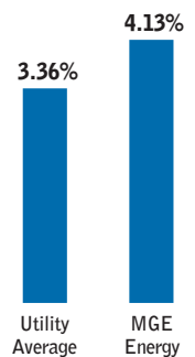
4-year dividend yield (2006 – 2009)

MGEE compared to top 40 utilities as ranked in a Public Utilities Fortnightly Survey.